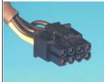
PCI-E 6Pin X 2