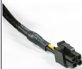
+12V-4Pin X 1