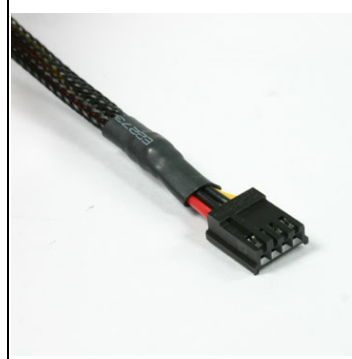
小 4P X 1