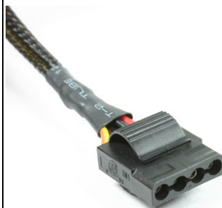
大 4P X 6